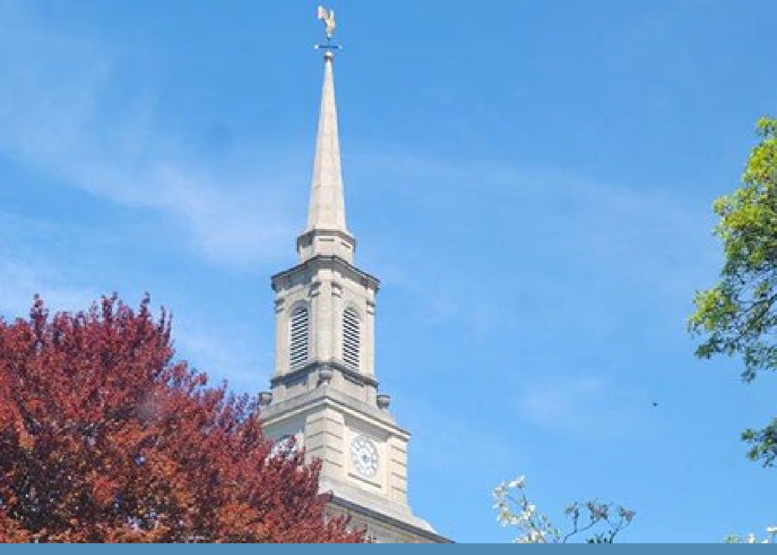
Students enrolled in the Graduate Certificate in Ministry receive a foundational understanding of ministry equipping them for broad service to the church. Required courses include theology or history; Bible; and two Preaching and Communications, Introduction to Caring Ministry, or other Ministry Studies courses.

This hybrid certificate is ideal for persons serving churches as Sunday School teachers, deacons, and elders, plus students who want to expand their knowledge of Scripture.