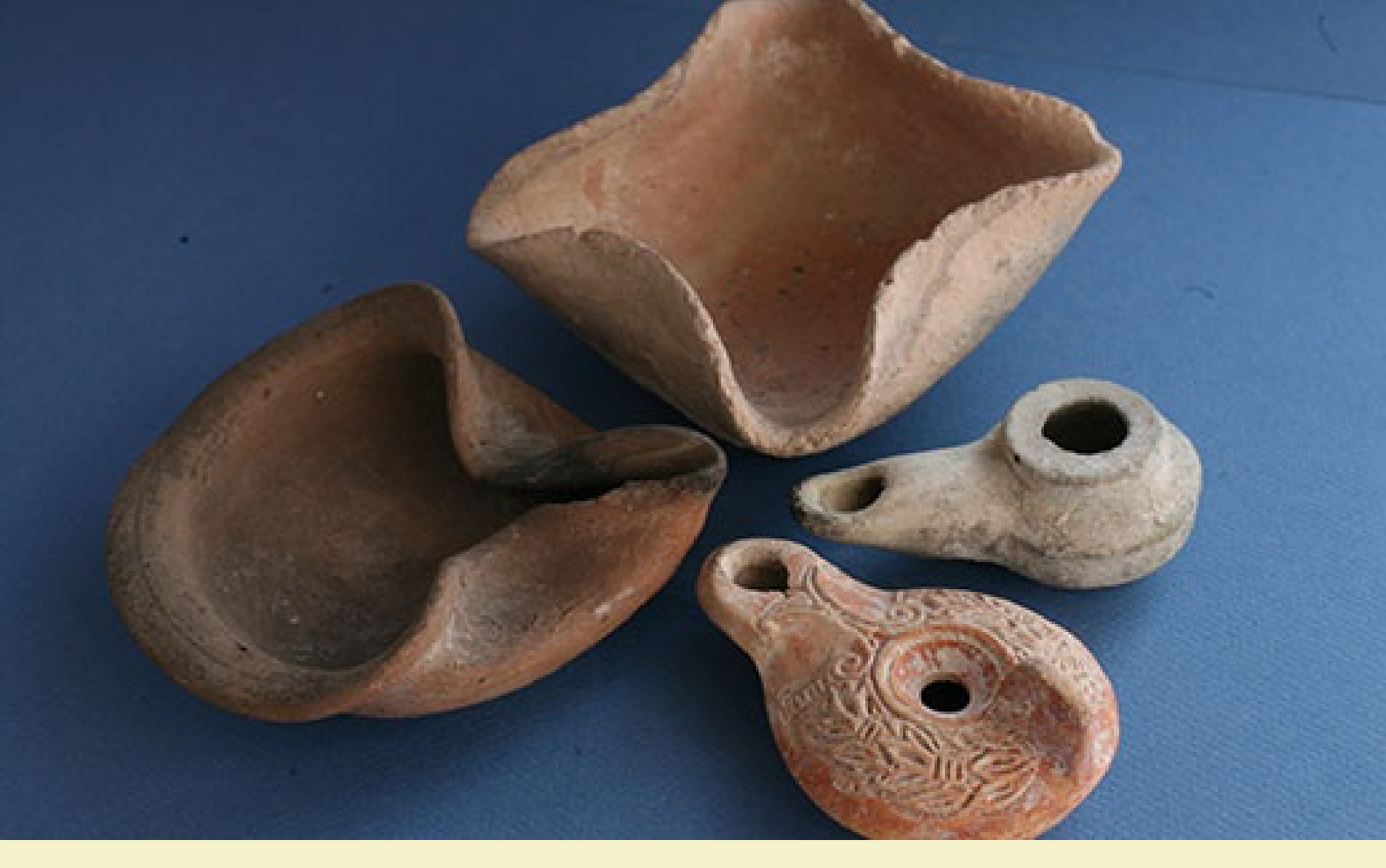
The Museum is part of the PTS Neighborhood Collaborative.